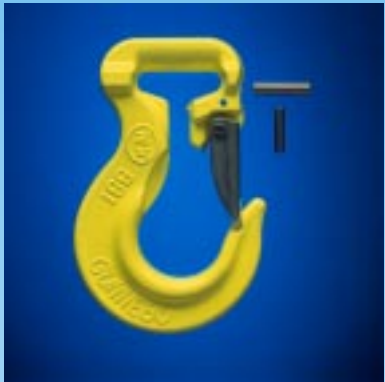
RH-hook with locking set.

The RH-hook fully conforms to the requirements of EN-1677 and is approved by BG/PZNM. Safety factor 4:1.