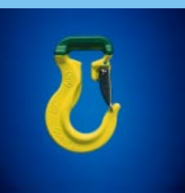
RH - 2 Ton - colourcoded.