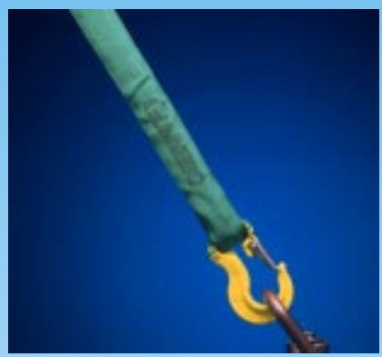
RH - 1-legged sling.